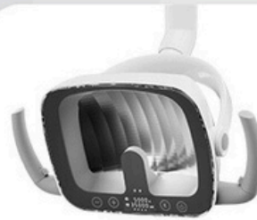
White Light Mode