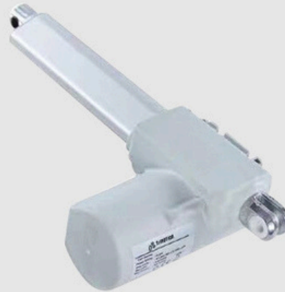
Taiwan Timotion Motor