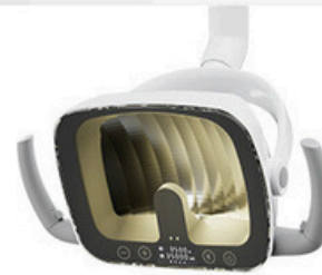
Yellow Light Mode