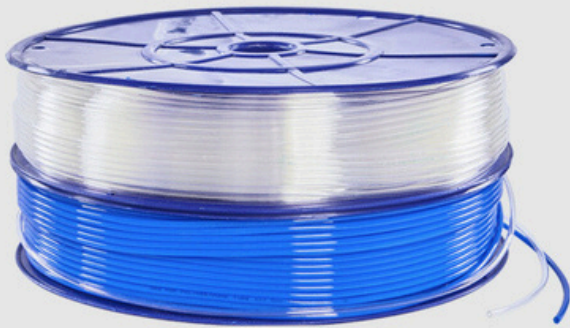
Medical Grade Durable Corrosion-resistant Water Pipe

High configuration to create standard quality