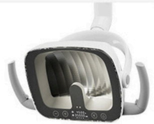
Mixed Light Mode